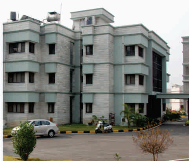
CSSTEAP hostel at IIRS

Indian food will be available in the hostel mess/canteen managed by officer trainees on payment basis.