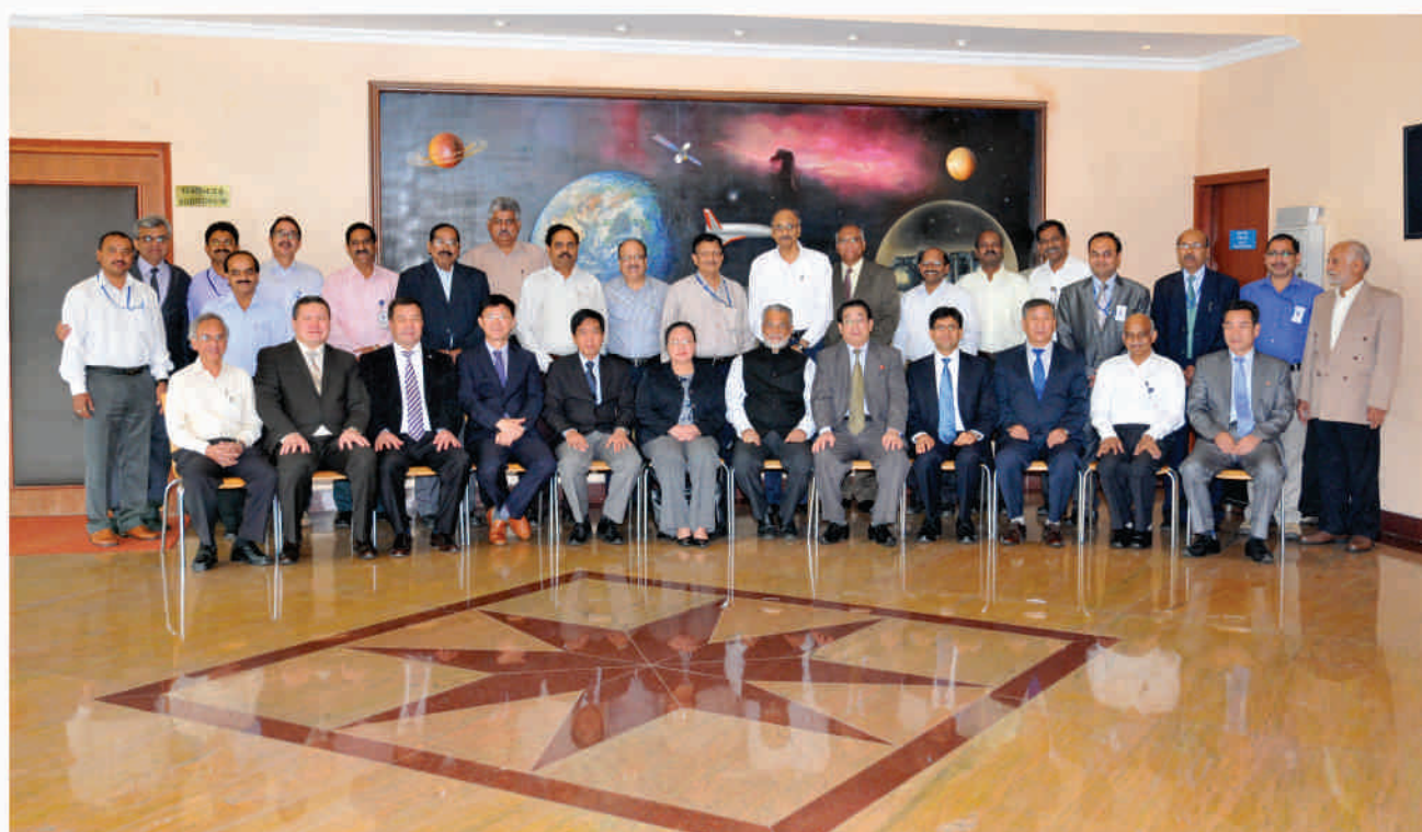
Participants of 19 th Governing Board meeting in ISRO Hqrs. Bengaluru