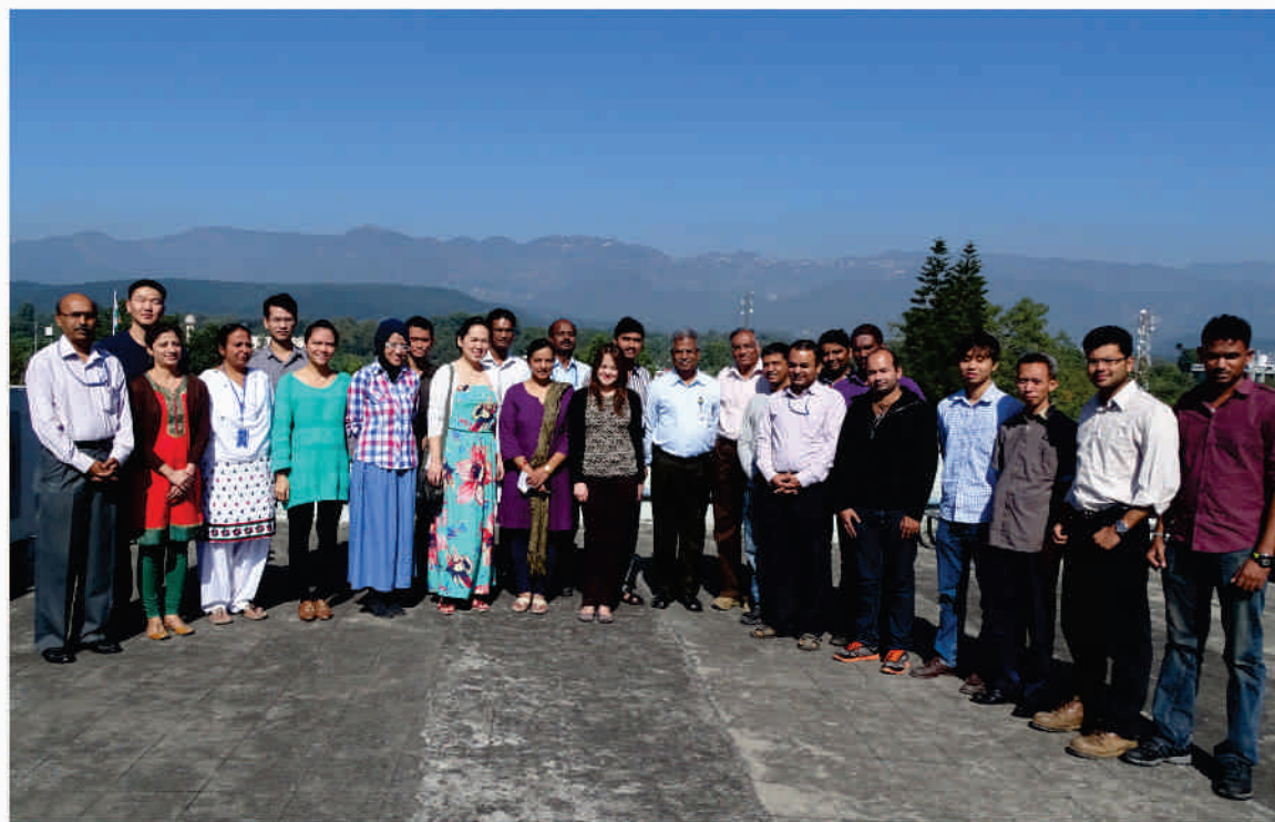
Participants and faculty of 3 rd Small Satellite Mission Course - 2014

4, Kalidas Road, Dehradun 248 001 (INDIA) Tel. : +91-135-274 4583 Fax: +91-135-274 1987