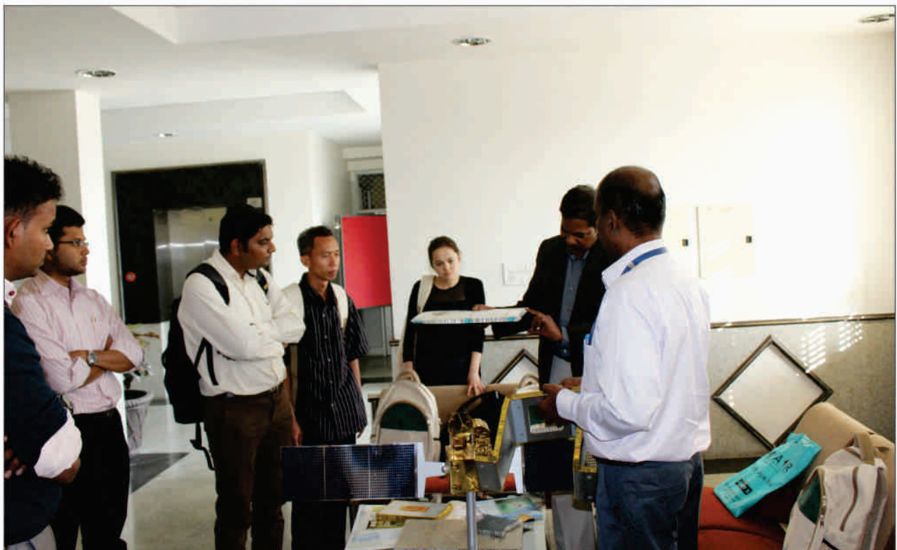
CSSTEAP participants during the demonstration session

IRS & SSS Programme, ISRO Satellite Centre, ISRO, Department of Space, Government of India, Vimanapura Post, Bengaluru-560017, India. Tel: +91-80-25082637, Fax: +91-80-25082444