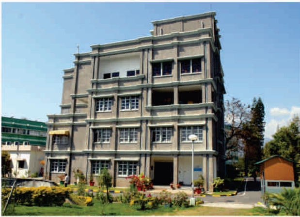
CSSTEAP HQ, Dehradun